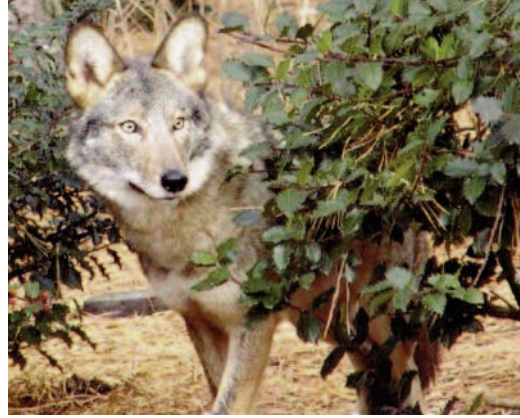
FIGURE 3D. Wild northeastern Coyote/Coywolf ( Canis latrans × C. lycaon ) from Cape Cod, Massachusetts, showing a robust German Shepard-like appearance. Photo: Anne Middleton, 2004, Dennis, Massachusetts.