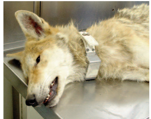
FIGURE 3B. Wild northeastern Coyote/Coywolf ( Canis latrans × C. lycaon ) from Cape Cod, Massachusetts, showing reddish-yellow coloration and white face. Photo: J. Way, January 20, 2004, Barnstable, Massachusetts.