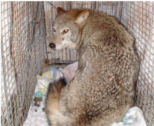
FIGURE 3A. Wild northeastern Coyote/Coywolf ( Canis latrans × C. lycaon ) from Cape Cod, Massachusetts, showing grizzled-gray coloration and whitish face. January 9, 2008, Barnstable, Massachusetts.

Qualitatively, northeastern Coyotes appeared more wolf-like than Coyote-like. The appearance of 50 individual northeastern Coyotes captured in Massachusetts was as follows: white-faced animals ( n = 10 ); dark brown and grizzled gray animals ( n = 13 ) often described as being like a German Shepherd; light brown and blondish ( n = 5 ), red ( n = 2 ); or dull gray animals ( n = 5 ) (Figures 3A, 3B, 3C, and 3D).