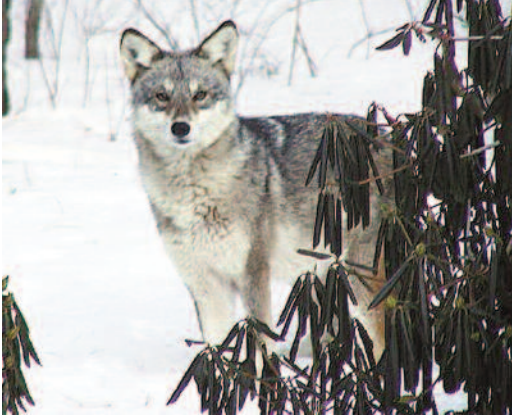
FIGURE 3C. Wild northeastern Coyote/Coywolf ( Canis latrans × C. lycaon ) from Cape Cod, Massachusetts, showing dark gray coloration and whitish face. Photo: Anne Middleton, 2004, Dennis, Massachusetts.